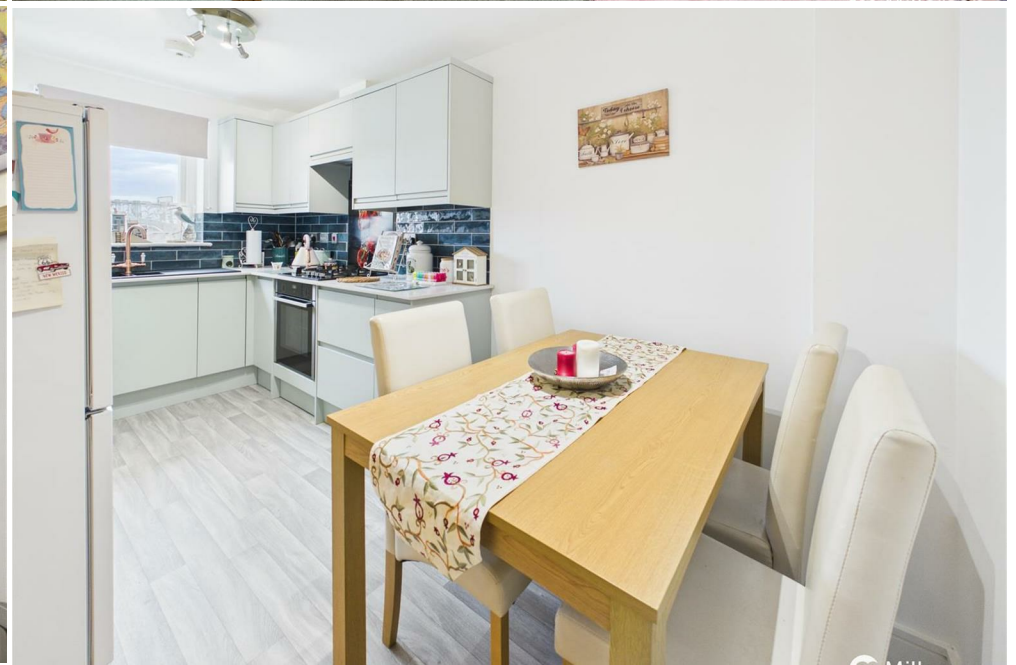
Kegin Terrace, Foundry Road, Camborne, TR14 8FT